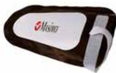
Disposable Ambient Light Shield