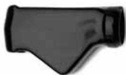
Reusable Ambient Light Shield