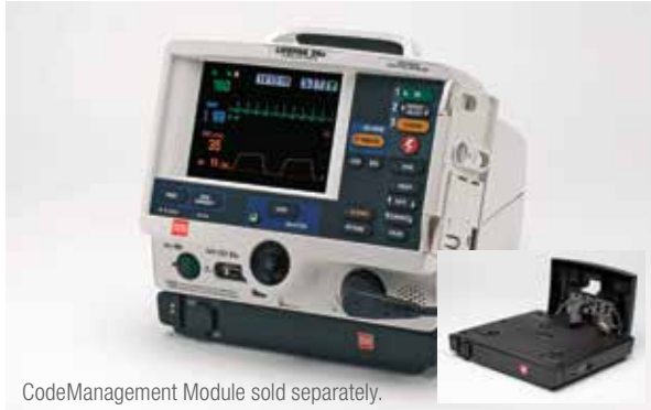
CodeManagement Module sold separately.