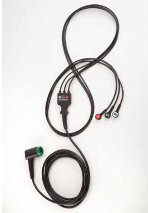
3-Wire ECG Cable 11110-000029