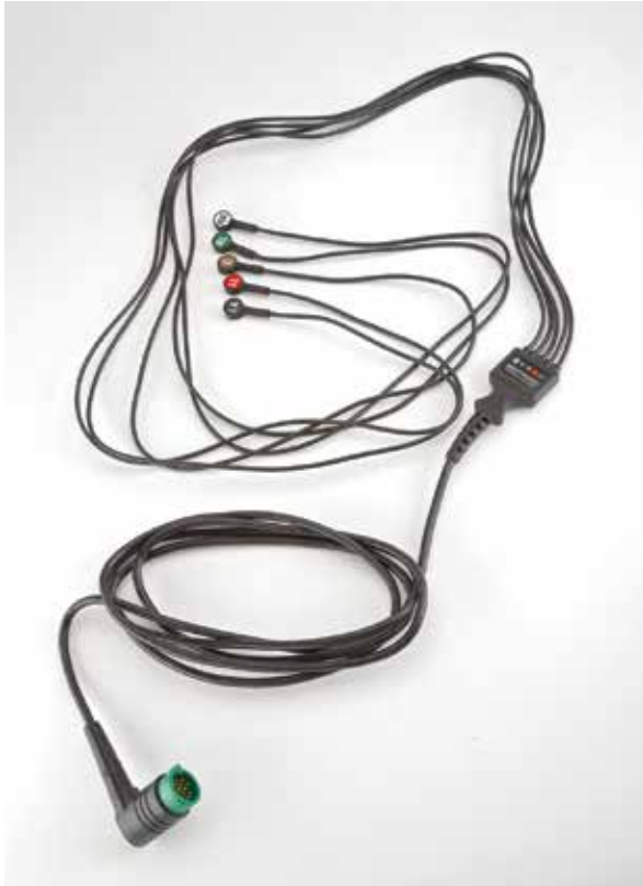
5-Wire ECG Cable 11110-000066