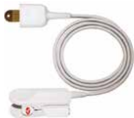
LNOP Reusable Sensor