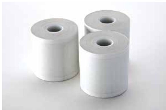
50mm x 22m ECG Printer Paper 11240-000013 (3 rolls/box)