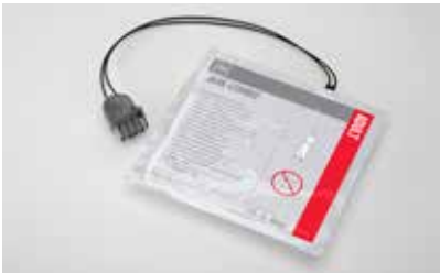
EDGE System Electrodes with QUIK-COMBO Connector and REDI-PAK™ Preconnect System

For use only with manual monitor/defibrillators; 12 month minimum shelf life at time of shipment. 11996-000093 (24" leadwire length)