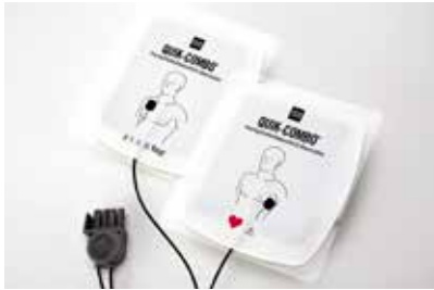
EDGE System Electrodes with QUIK-COMBO Connector

18 month minimum shelf life unless specified