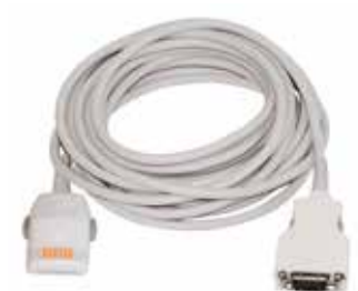
LNOP Patient Cable