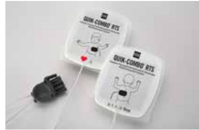
Pediatric EDGE System RTS Electrodes with QUIK-COMBO Connector

For use only with manual monitor/defibrillators; 12 month minimum shelf life at time of shipment. 11996-000093 (24" leadwire length)