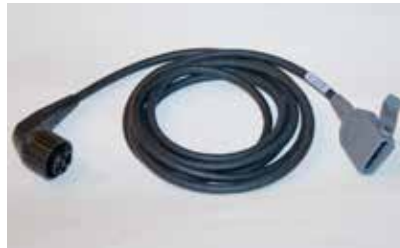
QUIK-COMBO Therapy Cable