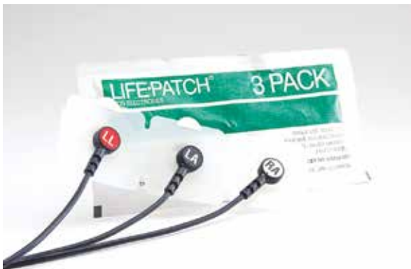
LIFE-PATCH® ECG Electrodes Adult, pregelled. 11100-000001 (3/pack) 11100-000002 (4/pack)