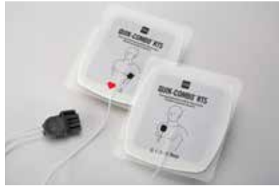
EDGE System RTS (Radiotransparent) Electrodes with QUIK-COMBO Connector