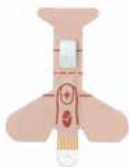
LNOP Adhesive Sensor (20/box)